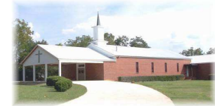
Prayerfully Moving Forward to Reach Another Soul